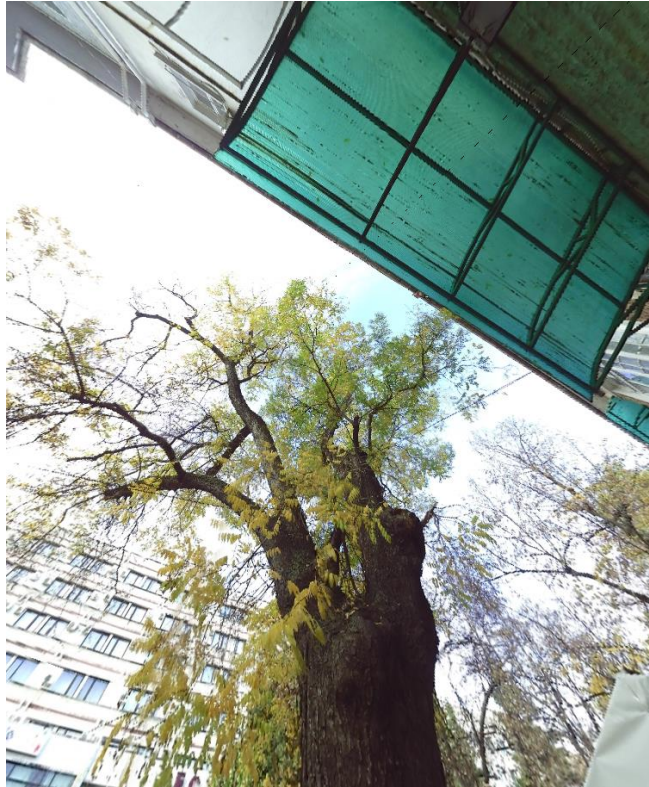
Fig. 1 The tall trees, situated next to the object

Another situation should be also observed in the field during the performing of the measurements. According to the technological possibilities of the scanner for creating 3D panoramic photos, the area around the scanner should be kept clear in order to be produced quality photos, required for the further geodetic activities, like recognition of the measured details of the object.