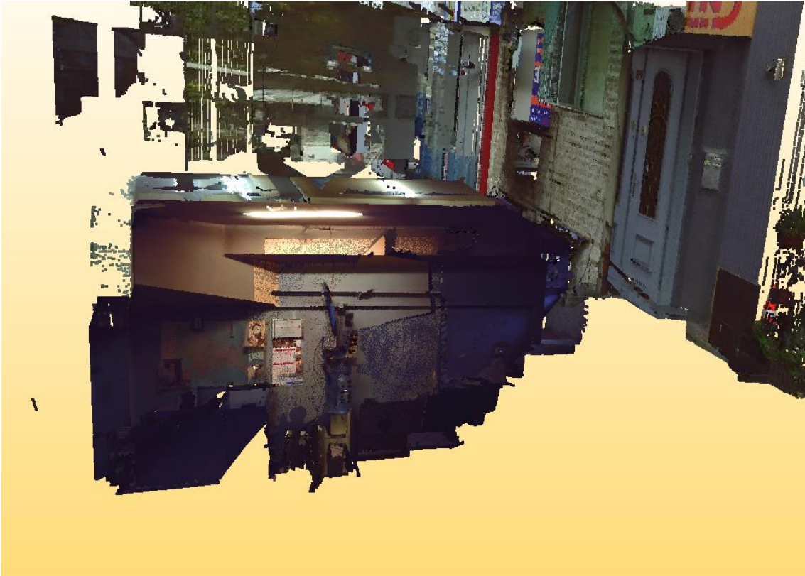
Fig. 5 The underground object

One part of the digital product – an extracted horizontal cross section (using the possibilities of Trimble Realworks) is given in fig. 6. In our case it was used to be obtained information for the position of the object in order to be created the digital model of the so called scheme of a separated object on the relevant floor of the building. In blue colour is denoted the point cloud and in green – the measured object. The nearby objects like stairs, walls, etc. could also be recognised.